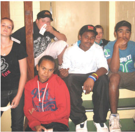
Year 9 100% Attendance Term 2