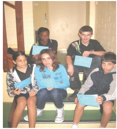
Year 8 100% Attendance