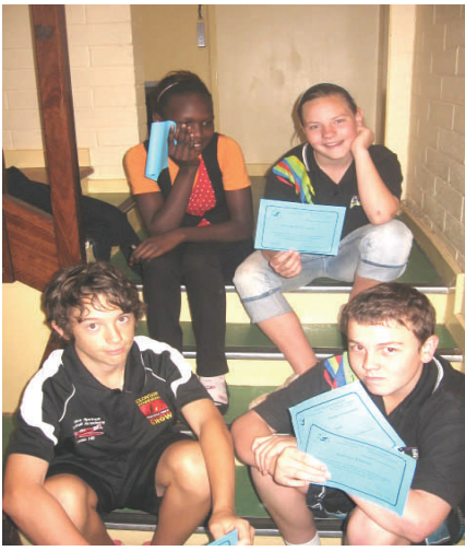
Year 7 100% Attendance