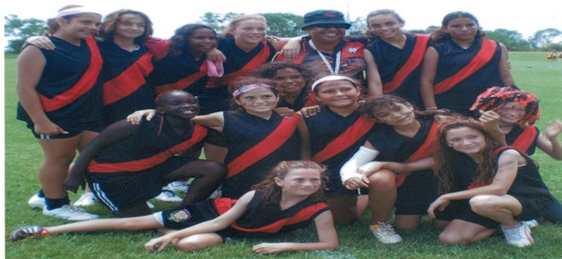
ALAWA PRIMARY SCHOOL – 2011 AFL GIRLS GRANDFINAL CHAMPIONS