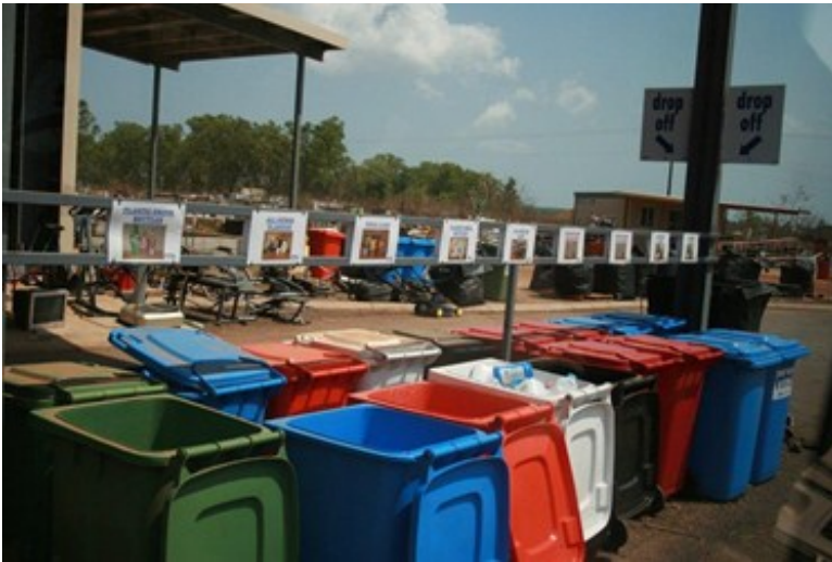
Colourful bins each representing the different kind of recycling that is now done at our Shoal Bay Recycling Centre