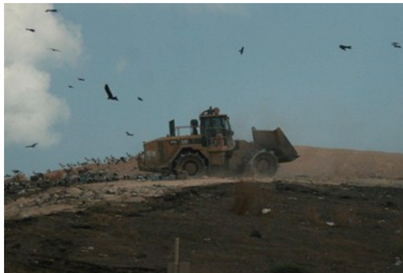
The huge equipment used at the Tip Face to move the non-recyclable rubbish, the birds love it, but manage to avoid getting crushed