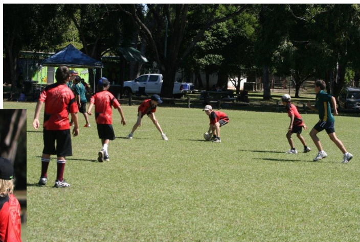
Having a go at the recent footy cluster sports event